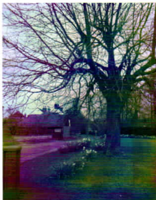
Outside Newhouse, Mersham

In response to the question "If junction 10A is constructed at the end of Kingsford Street/Highfield Lane, should both or either roads be closed off or made into one-way systems," there was an almost tripartite split between closing off, a one-way system and no change - a very inconclusive result. Information relating to the response from the residents of Kingsford Street, who would be directly affected, is unfortunately not available.