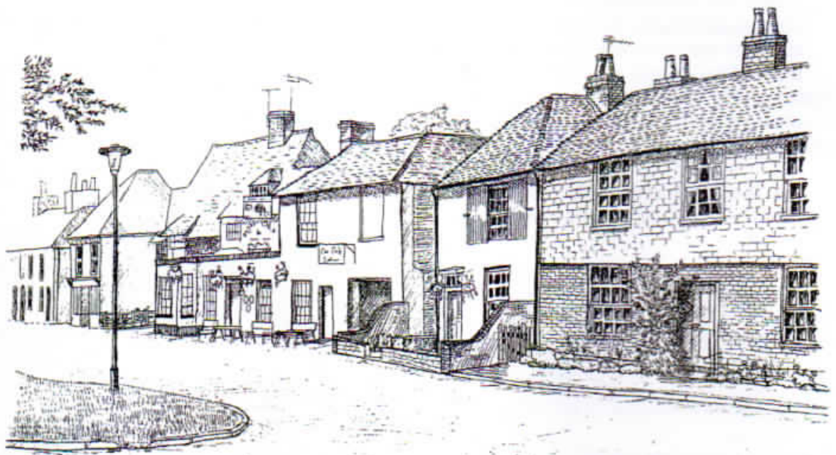
The Street, Mersham