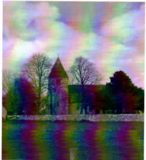
St John the Baptist - Mersham