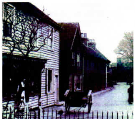
The Street – Mersham in the early 1900's

Sevington residents commented that they would like a shop nearer to them even if only a newsagents.