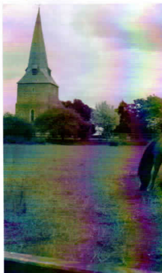
St Mary - Sevington

We recommend that efforts be made to prevent under-age drinking and anti-social behaviour at Sevington play area.