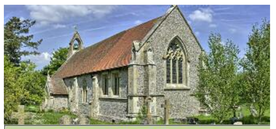
INVITATION TO ST LEONARD'S CHURCH, SUNDAY 5th MAY 3:00 pm

You are invited to attend a service of dedication for the new toilet and kitchenette at St Leonard's church, Cliddesden, RG25 2JQ