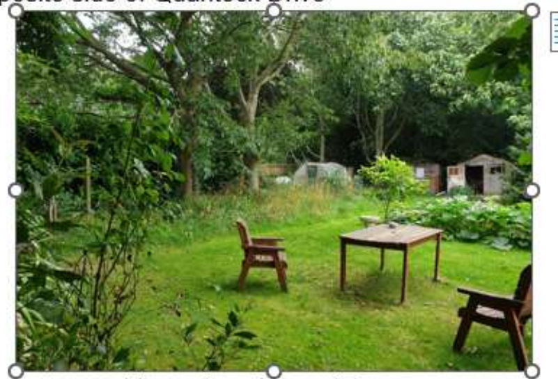
View of garden as it is now

Views from opposite side of Quantock Drive