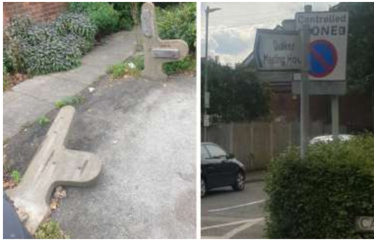
The bench was removed quickly by ABC

I reported the vandalism to the bench outside the Quaker House on Canterbury Road along with the damaged sign nearby that has been bent around by 180% - a prodigious feat of vandalism! (ref 738662)