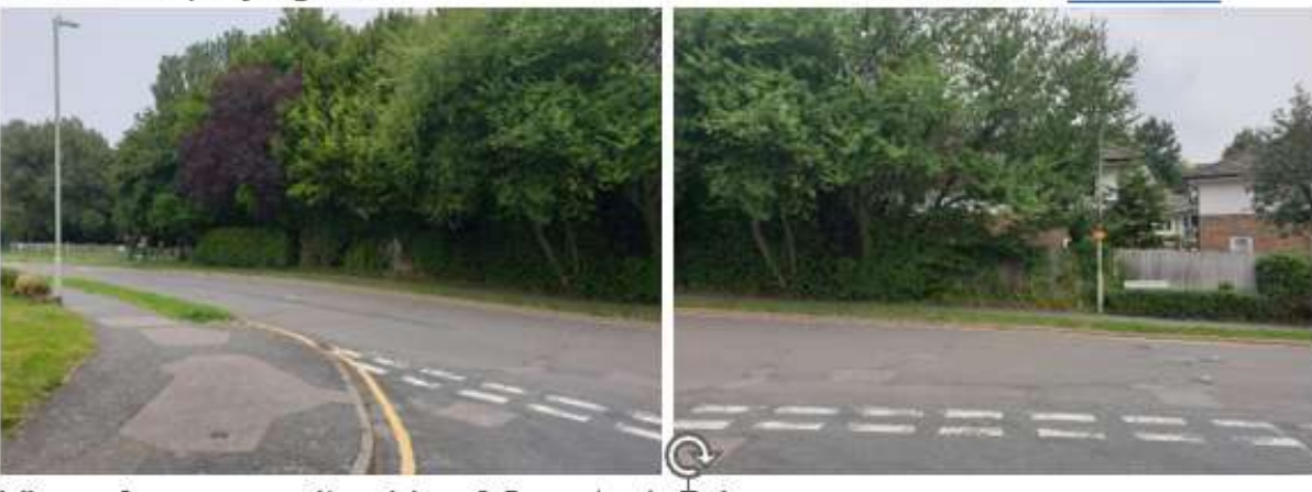
View from entrance

Views from opposite side of Quantock Drive