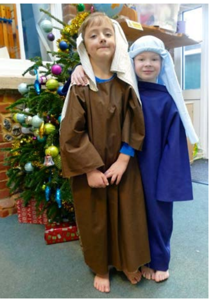
Willow and Beech Classes performed their Nativity, which featured a traditional storyline, alongside up-beat songs and excellent costumes. The children were amazing and were delighted to perform to their friends, family and wider community, including governors and children from Otters Nursery.