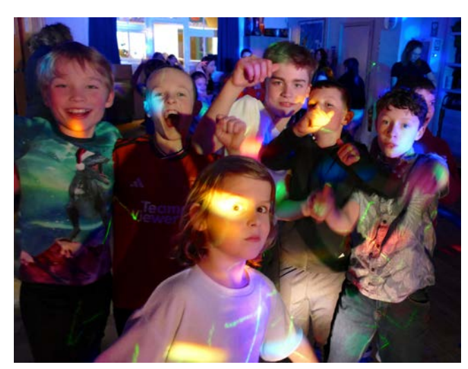
Wow what a night! It is safe to say everyone had an amazing time at the autumn disco. There was lots of fun and laughter and it was a huge success.