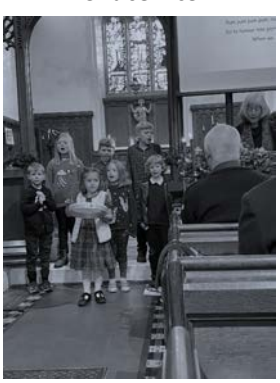
Children's singing group