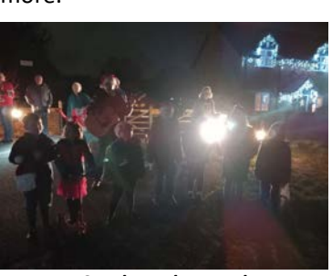
Carols at the pond

Why not try something new this January? There is something for everyone. Come along to a service and find out more.