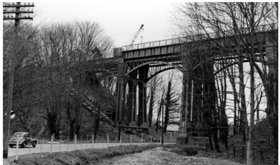
West Meon Viaduct being dismantled March 1957.

One of the major engineering works on the Meon Valley Railway route was the crossing of the Meon Valley itself just north of West Meon Station. The valley was made wide and deep at this point. The original design called for an 8 arch concrete viaduct. There is photographic evidence of the foundations being dug across the valley, but before construction started something changed their minds. At the same time the London and South Western Railway were involved in the construction of the Lyme Regis branch from Axminster which also involved a valley