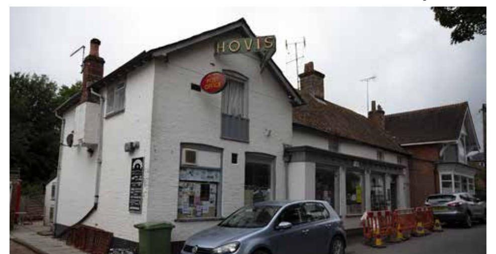
The West Meon Shop Committee

We are launching the Society on Saturday 4th July. It is true to say that not only do we love our wine but we also love to support our community. So in partnership with the Village Shop, members can discover new wines with our online recommendations and wine tastings. As a not-for-profit organisation, any surpluses go back to the Shop so it can continue to help serve our community. Our normal membership fee is £30 for a year's subscription. This entitles members to 15% discount off the entry price of up to two tickets to any society event attended by the Member. Given the current Covid-related uncertainties surrounding events, the Society is currently offering a discounted Membership Fee of £25 for an extended membership period to 31 December 2021. This offer will lapse on 31 August 2020. Membership applications after that date will be at our normal membership fee. For more information please visit the WMWS website: www.westmeonwine.co.uk.