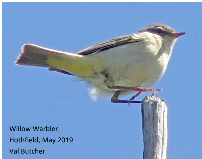
Willow Warbler Hothfield, May 2019 Val Butcher