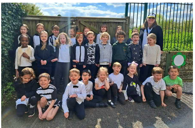
The children enjoyed this opportunity to fully immerse themselves in the lives of penguins.

On the day, we explored Antarctica and the lives of different penguins.