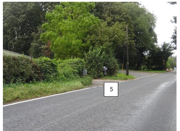
Pipes under Cherry Tree Farm Entrance towards Industrial Estate