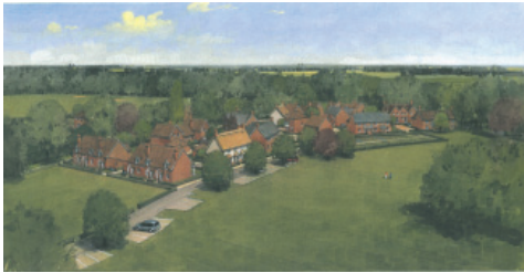
Morley's Lane development site

can be summarised as follows: - Support – 4, No Objection – 37, No Comment – 17, and Objection – 4 which is roughly in line with the pattern in 2012.