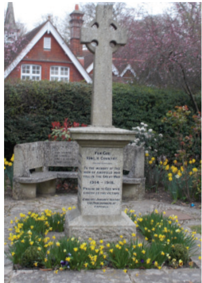
The War Memorial at Knapp Lane

To mark the 100th Anniversary of World War I the cover images are taken from the British war memorials, and honour those lost