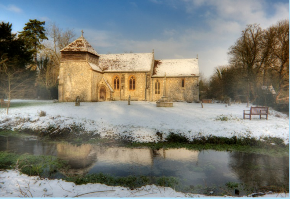
St Swithun's Church, Headbourne Worthy

service - but no 10.00 service. All villagers will be warmly received at any or all of these services.