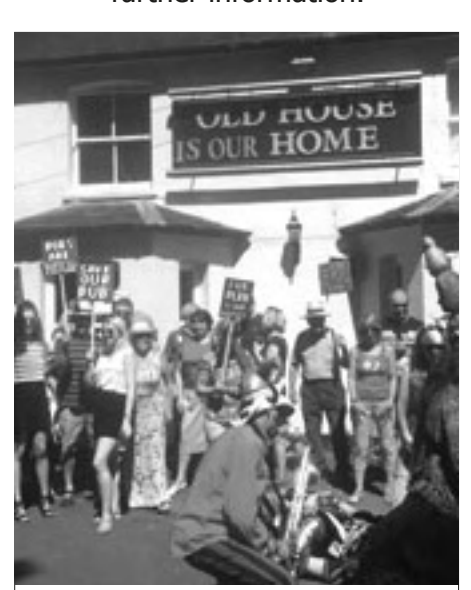
Still awaiting news from Planning. No news not necessarily bad news...

Please visit newnhamclubroom. org.uk for availability, booking and further information.