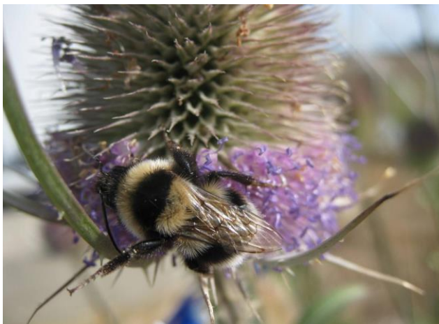
Ruderal Bumble Bee.

The Bumblebee Conservation Trust has been working with the village of Rolvenden to provide habitat for these important pollinators. Several areas within the village have been enhanced, starting with the War Memorial where native spring bulbs were planted last autumn. These included native daffodils, tulips, muscari and snake's head fritillary – all of which are great food sources for pollinators at a time where this is often lacking. Native primroses and cowslips are another great early food source and will be planted in the Churchyard and around Tanyard Flats this spring. In these areas, cornfield annuals will also be sown. In other parts of the village perennial wildflower areas are being established. By reducing the mowing regime of road verges (starting with the strip on from the church to the vicarage) it will allow existing wildflowers to flower. This area was also sown with yellow rattle last autumn, which will suppress the grass and open up the sward, allowing the wildflowers to thrive. An area of the playing field in Rolvenden Layne is also being left to grow and was sown with yellow rattle and a perennial wildflower mix last autumn. These areas will not only produce beautiful displays, but will also provide vital sources of pollen and nectar throughout the summer months.