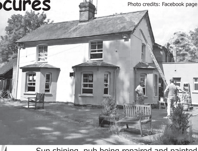
Sun shining, pub being repaired and painted

18/01071/FUL (7 June) High Ridge House, Owens Farm. Erection of a new building for 11 stables and tack room for applicants' personal use and erection of an agricultural / equestrian hay barn plus new storage building following demolition of existing storage building