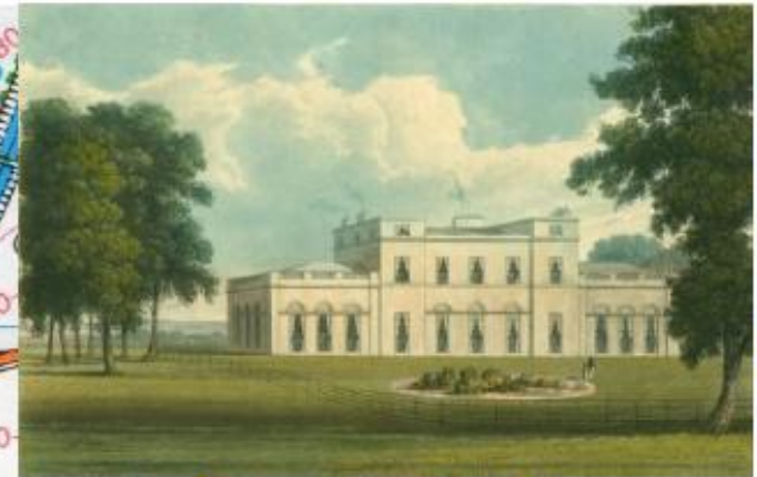
The "new" Worthy Park House in 1825