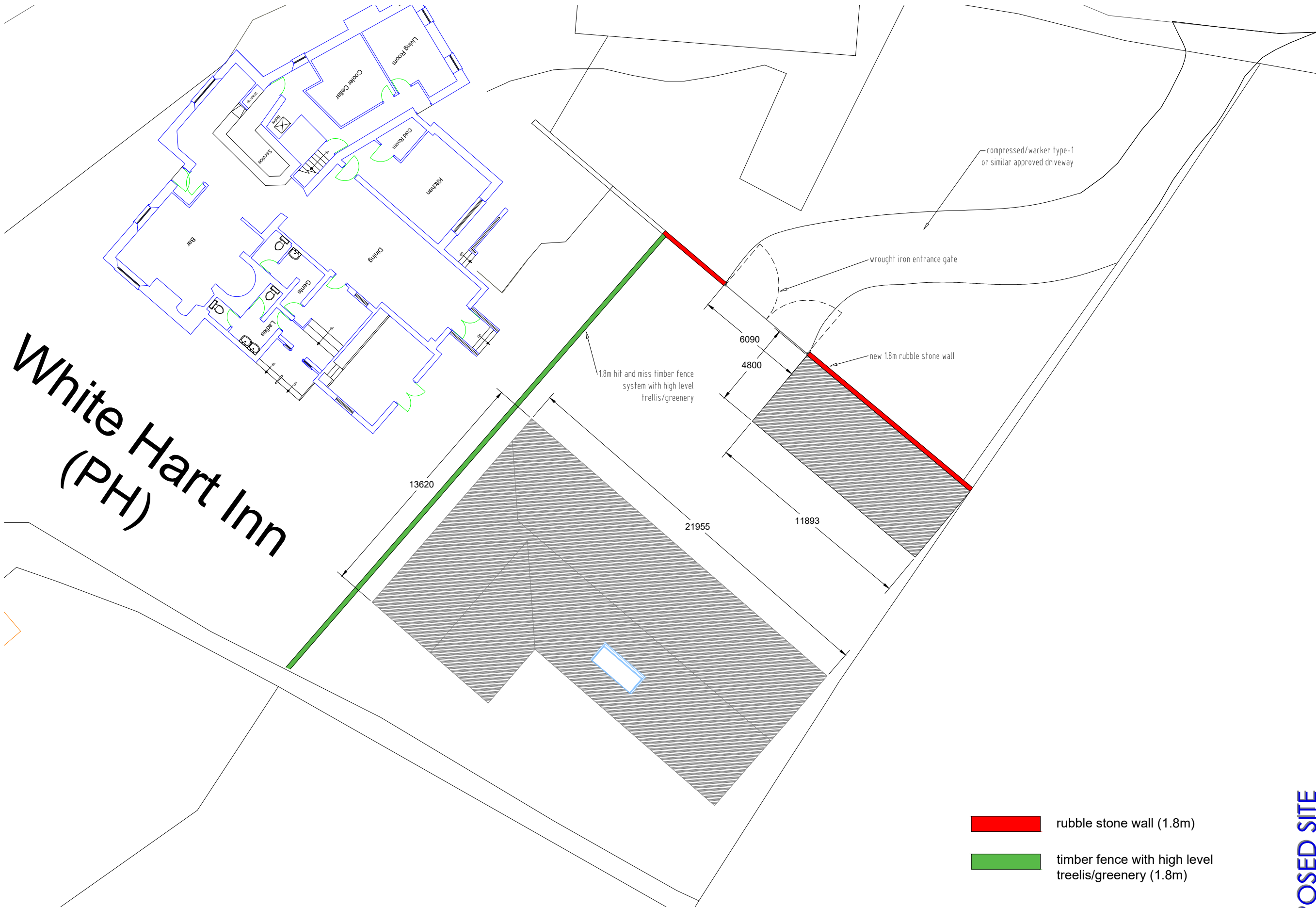
proposed site plan 1:200 @ a3