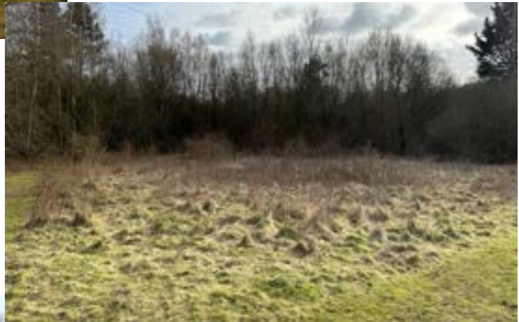
Right and below: the planted saplings