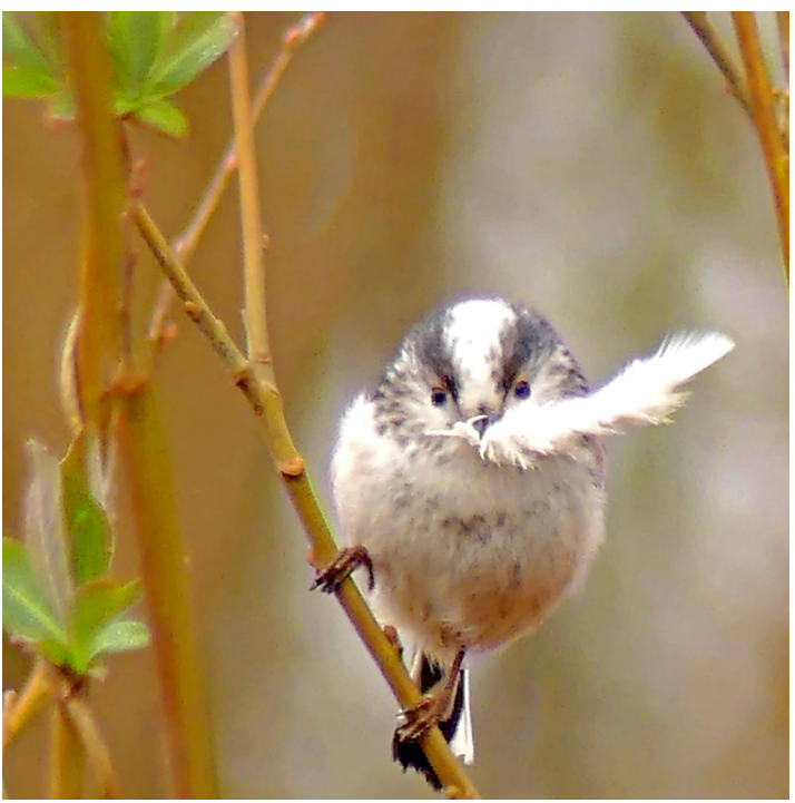
Long-tailed Tit collecting nesting material