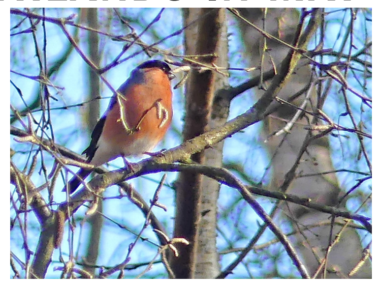
Bullfinch Hothfield 2021

Hobbies, snipe and bullfinches are among the April bird sightings. Listen out for nightingales and cuckoos in May. Back in March, rooks were seen pulling hair off the back of the highland cattle for nest material, while smaller birds were collecting spiders' webs. May is full nesting season across the whole