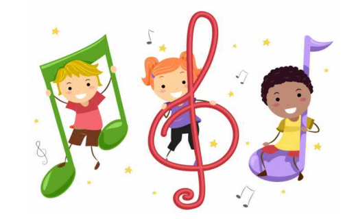
A fun, free, friendly group.

Come along, meet new friends, and learn new songs from a professional music teacher!