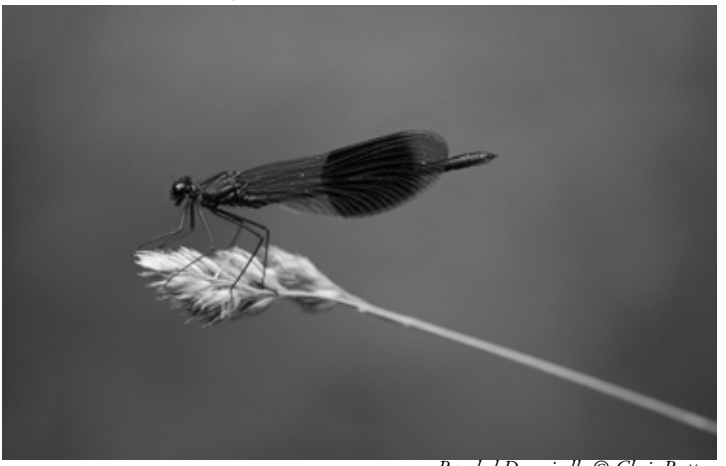
Banded Demoiselle

The name for these species together is Odonata, and they are closely related. There are 46 species that either regularly breed in Britain or are common migrants from Europe, with a further ten occasional migrants. They come in a huge variety of colours and sizes and will visit all sorts of freshwater habitats.