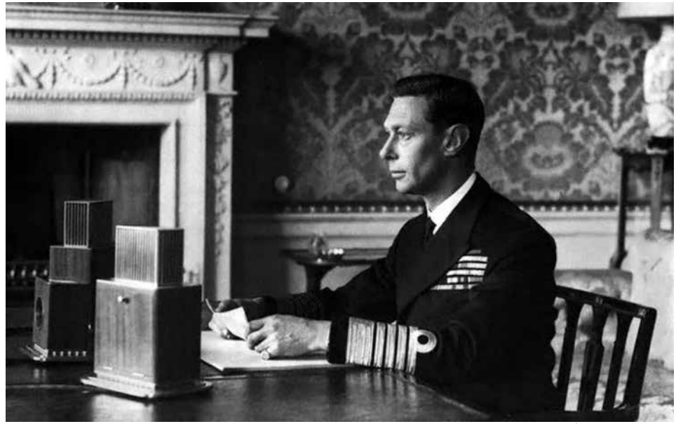
King George VI Christmas message 1939

from slavery in Egypt to freedom in the Promised Land they spent a lot of time complaining that life was now even worse; 'At least in Egypt we had food to eat. Why can't we just go back?' There is safety in the familiarity of what we know.