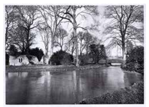
East Meon History Archive: Michael Blakstad

An ancient puzzle of one of Hampshire's vanished villages could be solved as a result of a scheme aimed at halting the decay of a ruined chapel near West Meon.