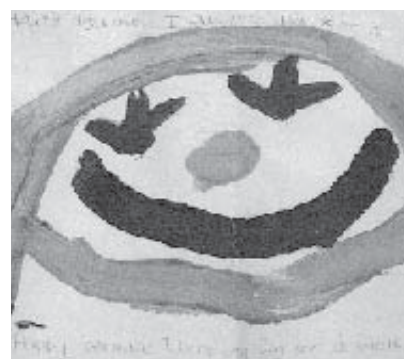
Happy, by Lydia, aged 5.