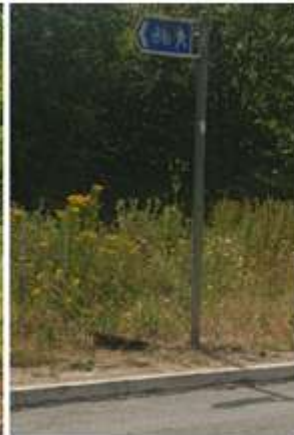
Put up, but in wrong direction