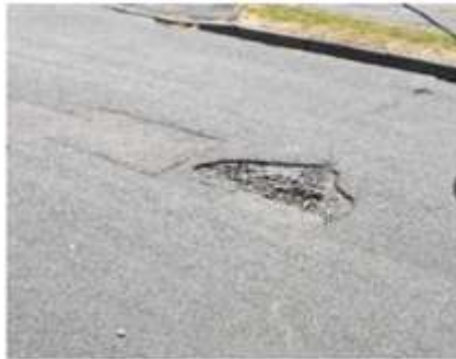
Potholes near Malvern Rd

The potholes I reported in Qantock Drive (Malvern Road end, ref 726229) were repaired within 10 days and additional work has been marked up for action by Highways.