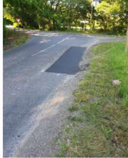
Frith Road (junction with Ashford Road)