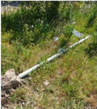
Sign knocked down

HGVs have knocked down the cycle / footpath sign on Church Road (east) again! I have reported to KCC under ref 725158. It was put back up but unfortunately was pointing in wrong direction which I reported under ref 703755. It was put right quickly.