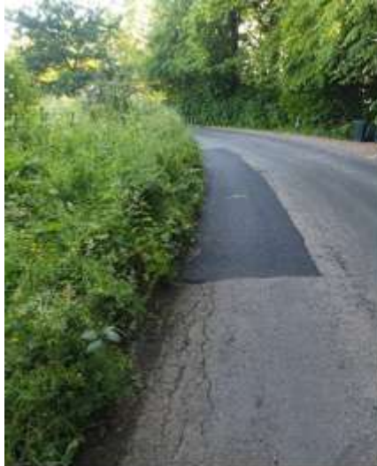
Flood Street (near Stone Green)