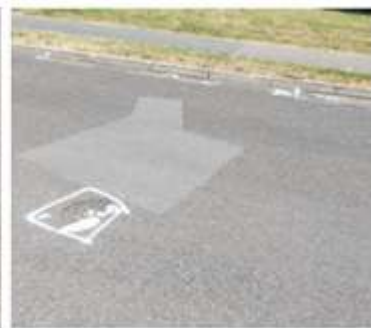
and more marked up for action.