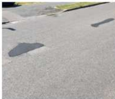
Fixed in 10 days