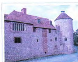
Westenhanger Castle near Folkestone, birthplace of Sir Thomas Smythe

Thomas was one of 13 children and the second surviving son. He attended Merchant Taylors' School in the City of London and then followed his grandfather into the Skinners' Company and his father into the Haberdashers' Company, becoming a freeman of both by 1580. It was at this time in Elizabeth's reign that attention turned to the colonisation and exploitation of the riches of the New World. Discovery and trade in the far flung corners of the world were becoming patriotic goals, emboldened by the race with Spain and the Netherlands. Thomas was an eager and wealthy participant. It is said that in 1588 he lent £31,000 to Elizabeth to enhance the English fleet which was to go on to defeat the Armada. He became Master of the Haberdashers' Company in 1599 and Sheriff of London in 1600. Unfortunately he fell briefly