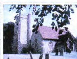
St. John the Baptist Church, Sutton at Hone, burial place of Sir Thomas Smythe

In the letter he writes: "... I do also give to the Parish of Tonbridge toward the maintenance of the poor for the year insuing, ten pounds and eight shillings; with the direction that the Minister and Church Wardens of that Parish or Some of them provide weekly twelve fourpenny loaves of good bread, and give it every Sabaoth day at the Church to twelve of the poorest and honestest, in their opinion, dwellers in the Parish, which doe frequent the Church ..." Similar arrangements were made in the Parishes of Speldhurst and Bidborough. Sir Thomas wanted to carry on the work of his grandfather in helping Tonbridge School, by increasing the stipends of the Master and the Usher and providing exhibitions to support pupils at the 'Universitie'. In 1621 he enclosed money for distribution and to provide six pens for the six best scholars 'who shall dispute in the Examinations'.