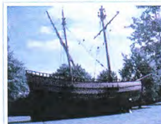
Replica of 'Discovery' at Westenhanger Castle

By 1600 Smythe had become the Governor of the Muscovy and Levant Companies and between 1604 and 1605 he was ambassador to Russia. Competition with the Netherlands and with Spain as well as other trading nations was intense, and as Governor of many trading companies he was often negotiating with these countries. At about this time there was considerable interest in finding an alternative route to India by locating a North West passage between Greenland and Canada. At various times between 1600 and 1621, Sir Thomas was the Governor of the East Indies Company and on their behalf he commissioned the building of the 20 ton flyboat Discovery to find this elusive passage. In the early years of the 17th century it undertook six expeditions funded largely by Sir Thomas. In 1606 the boat was transferred to the Virginia Company and it accompanied the Susan Constant and Godspeed on an expedition to Virginia funded by Sir Thomas. The expedition was successful and Jamestown was founded in the new colony of Virginia in 1607. The boat was eventually left there, but a replica was built in the USA in 1984 and transported to London on the quadricentennial of Jamestown in 2007. It has now found a permanent home at the birthplace of Sir Thomas at Westenhanger Castle.