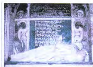
The tomb of Sir Thomas Smythe at Sutton at Hone

Sir Thomas was mindful of his extended family in his Will and donated sums of money to his nephews and nieces of whom there were many. In addition, he provided money for specific purposes such as to buy a ring or a horse and in one case a coach and horses, depending on their needs and his inclination. He freely distributed money for rings among friends and relatives to 'show his love' and so that they might remember him. Apart from the many and varied small sums given to relatives and friends, Sir Thomas bequeathed money to his business colleagues at home and abroad. Some money was to be used to pay off debts incurred by some of his colleagues and some to benefit the plantations, most notably by the building of two churches, one in Virginia and one in the Bermudas, to which £100 each was given.