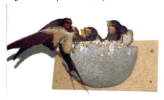
Figure 13 - Example of swallow cup