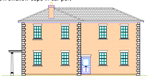
North West facing Elevation