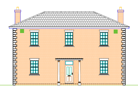
North East facing Elevation