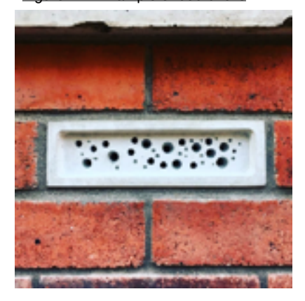
Figure 14 - Example of bee bricks