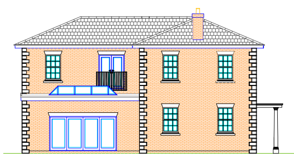
South East facing Elevation