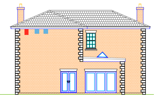
South West facing Elevation