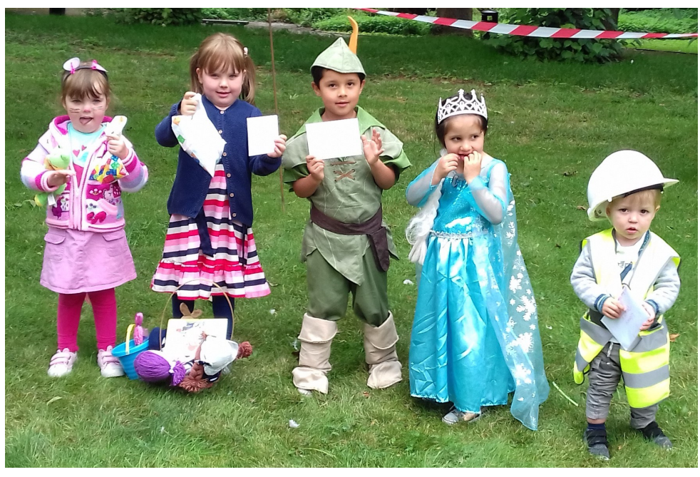
KINGSCLERE PHOTO CLUB

Our Summer Reading Challenge was a great success and we were delighted to sign up 72 children. The end of the summer was our Fancy Dress Competition at the Kingsclere Fete, with our outstanding entrants pictured below: