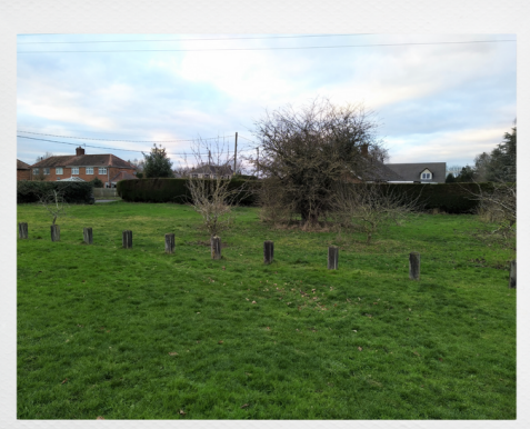
Rodington Community Orchard

We're really happy therefore to be able to report that our first big project is up and