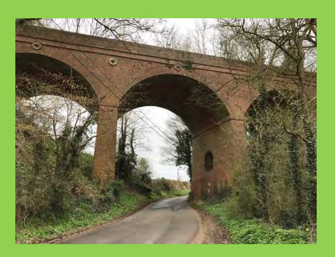
Registered Charity Number 1167675

A 26 mile circular walking route North East of Winchester. Many sections are open for cyclists and horse riders.