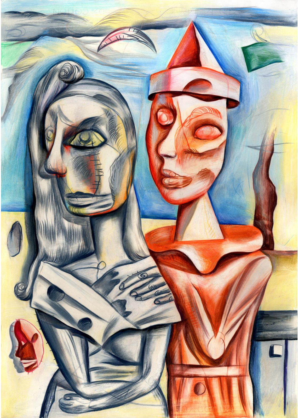
Odd Couple by Alisha Sufit