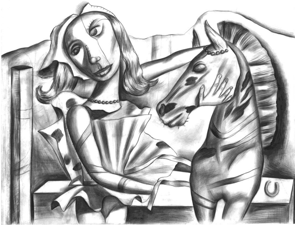
Princess Zebra by Alisha Sufit