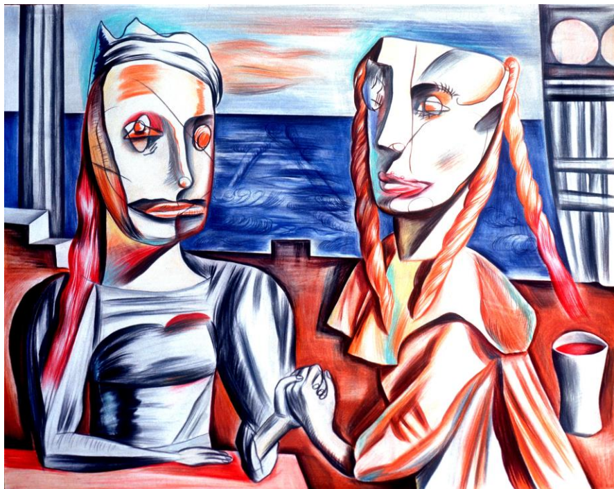
Female Friends by Alisha Sufit