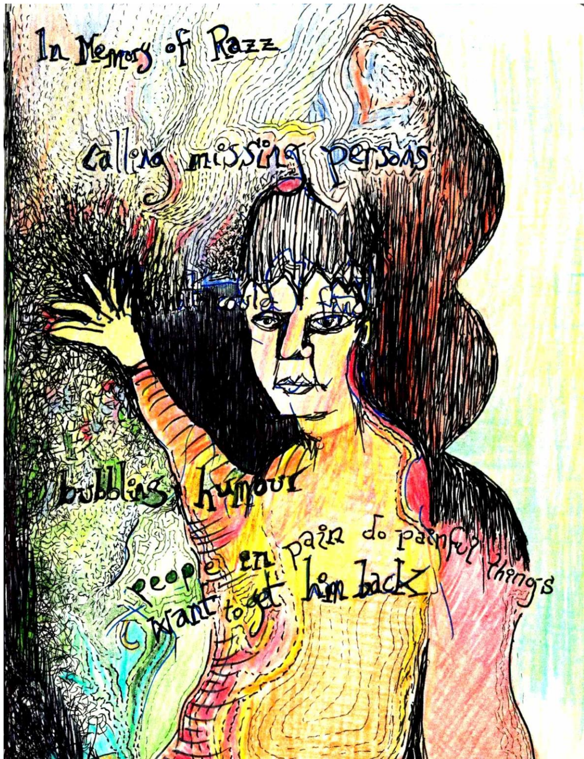
Calling Missing Persons