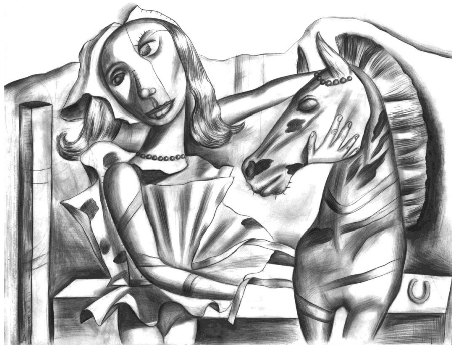
Princess Zebra by Alisha Sufit