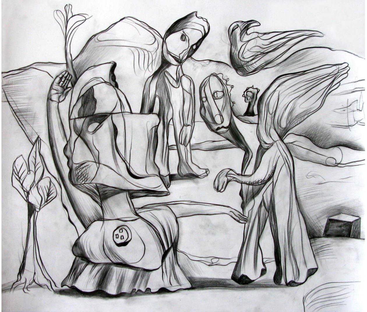
Slight Evolutionary Detour by Alisha Sufit