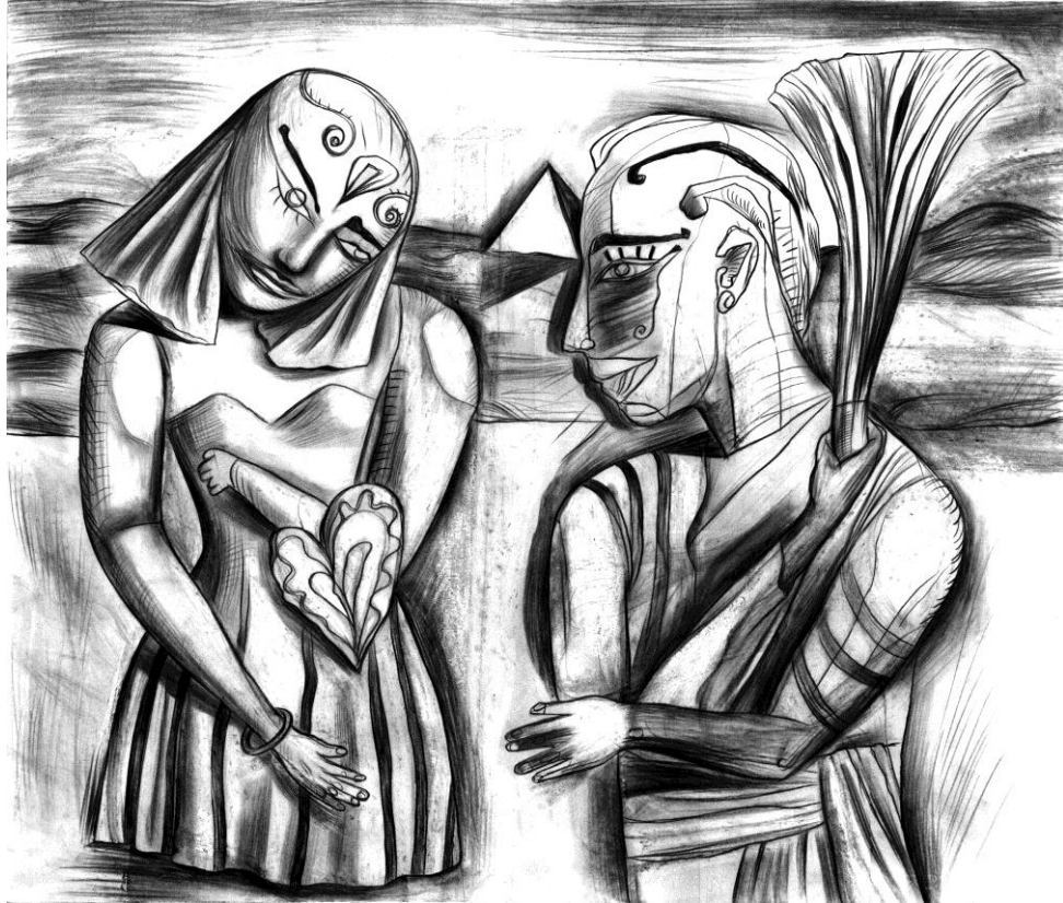
Heart on Your Sleeve by Alisha Sufit