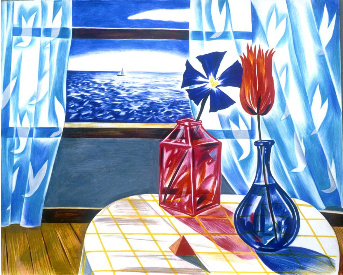
Boy Meets Girl by Alisha Sufit

ISSN 2056-970X (NB: all back issues of the Newsletter are now ISSN registered)