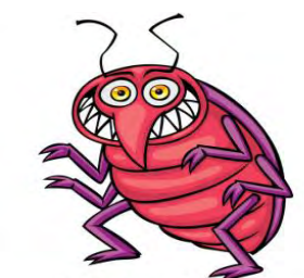
Asian Beetle spots an English Ash Tree

As a footnote to last month's article on Ash Die Back and the untimely arrival of the Asian Beetle that seeks to make his family home in an ash tree, I am including an illustration of the pesky flying insect that we should be on the lookout for!