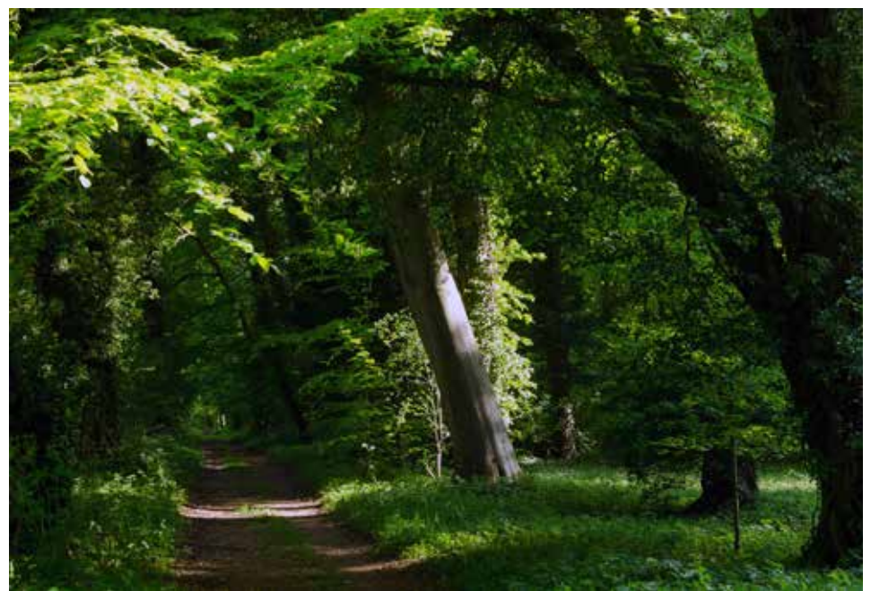
Path through Chappetts Copse.

We are removing the trees because many of the ash trees in the woodland have been killed by ash dieback disease. Contractors will be removing ash trees from the northern end of the woodland, extracting timber via Coombe Lane.