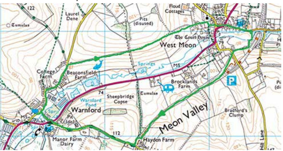
Follow the route description on page 7 if starting from Warnford or join halfway from West Meon.

If you want to walk more there are many local footpaths. For example you could start with this one which links our parishes.