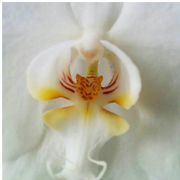
An orchid that looks remarkably like a tiger