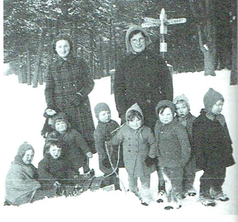
The winter of 1940 was the coldest on record. Sledging and snowball fights with the Bethnal Greenies.

me at: hothfieldmemories@hotmail.com for more information.