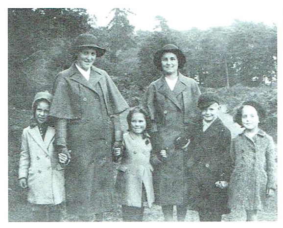
Out for our daily constitutional. Most of the evacuees were seeing the countryside for the first time.

The village's history website: www.hothfieldmemories.org.u k lists other publications that are about Hothfield or which have references to Hothfield. Some of them have been written by past or present Hothfield residents. The History Society's own publications are available on memory stick (flash drive), CD (Word for Windows documents) and our book on the village in the 20th Century is also available in paper copy. Please e-mail