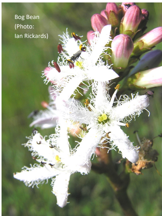
Bog Bean

butterflies and moths and the wonderful southern marsh and heath spotted orchids. And, as the volunteers, anxious to get back to work, well know, the bloomin' bracken and birch are growing well!