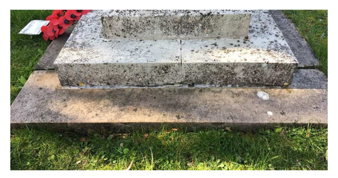
Fig.2 Detail of paving showing movement from tiered base.

The paving to the right-hand side (as facing) of the memorial has become detached from the memorial, probably due to natural ground settlement. We would recommend that the joints are repointed and monitored for future movement.