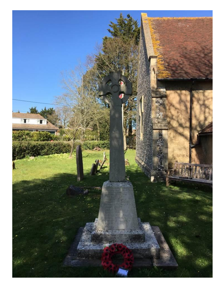
Fig.1 Bodle Street Green War Memorial, front elevation, April 2021.