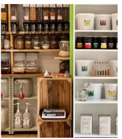
Opening hours 10am – 5pm Monday to Saturday

Those who prefer to see their shopping before they buy, or purchase the amount they need instead of having extra sitting in the cupboards for months...Look no further. Visit the Local Zero shop at the Weyhill Fairground. There is something to be said about shopping sustainably; it feels good! Not only are you supporting local businesses, but you are also reducing plastic waste and doing your bit for the planet!