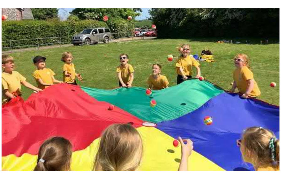
Our Year 2 children letting off steam and enjoying fun and games on the field following their SATs tests.

We rewarded them with a tasty cooked breakfast every day and after the final test the children had an afternoon of bowling at The Hollywood Bowl.