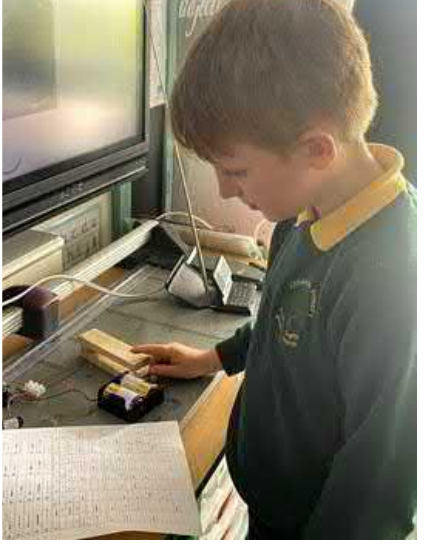
decoded their own messages and were able to send messages on a replica morse code machine. The afternoon was very interesting and informative.

On Wednesday 23rd May, Chestnut was lucky enough to have Mr Wood present an interactive workshop on Morse code. We learnt all about how Morse code was invented and how it has been used over the years. We looked at how Morse Code was used on the Titanic and why the distress signal was not received quickly enough to help. The class