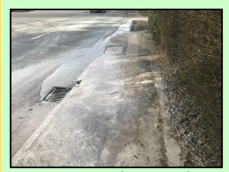
Ice on Dickets Lane (stock photo)

When the natural or designed flow of water is interrupted the consequences can be quite serious. One example is that water flowing down Hollands Lane towards Blaguegate Lane/Dickets Lane (A577) has caused problems for many years and the problem has been complicated by land ownership issues. Hollands Lane itself has no known ownership. Although it is a public footpath, in common with many such footpaths it is not maintained by the highway authority (Lancashire County Council). The most recent public