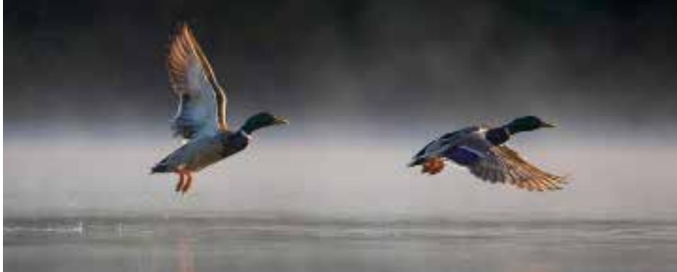
Pair of Mallards

Winter into spring is a wonderful time to see wildlife and birds especially. As the cold grip of the Arctic winter takes hold on the lakes, pools and marshes of Northern Europe and Russia, huge numbers of swans, ducks and geese retreat to the relative warmth of the UK. The UK's lakes, rivers, reservoirs and coasts offer a winter home to an estimated 2.1 million ducks!