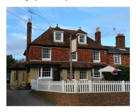
11) The Ewe and Lamb Public House