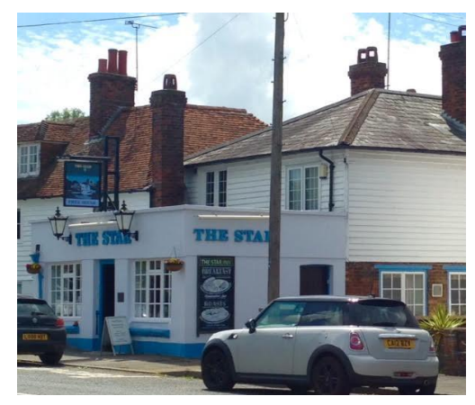
9) The Star Public House