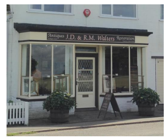
10) JD and RM Walters Antiques and Restoration