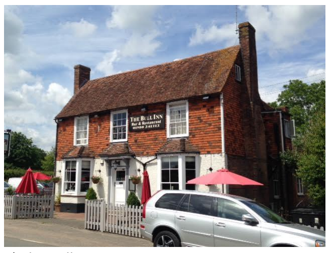
3) The Bull Inn