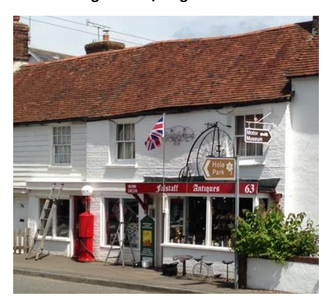
2) The CM Booth Motor Museum/Falstaff Antiques