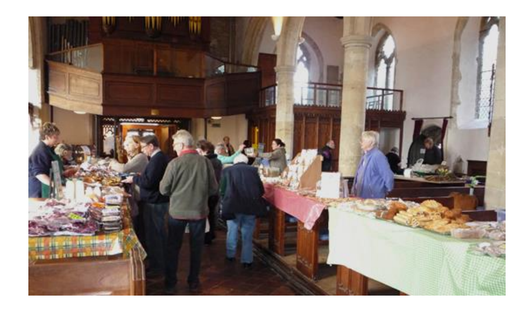
7) Rolvenden Farmers Market in St Mary the Virgin Church (Thursday mornings)