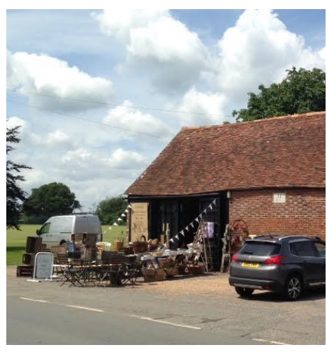
4) Cindy's Antiques