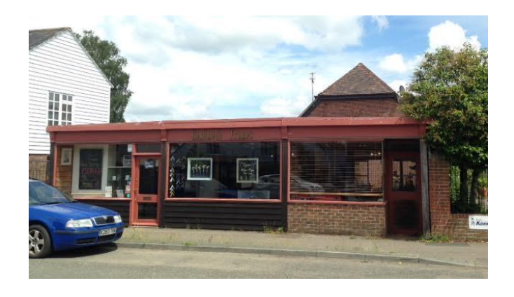
5) Handmade Frames – picture framers