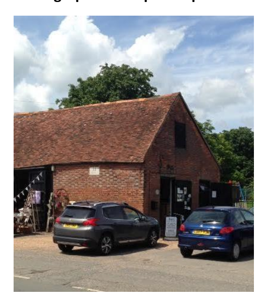
1) The Barn Hair Studio