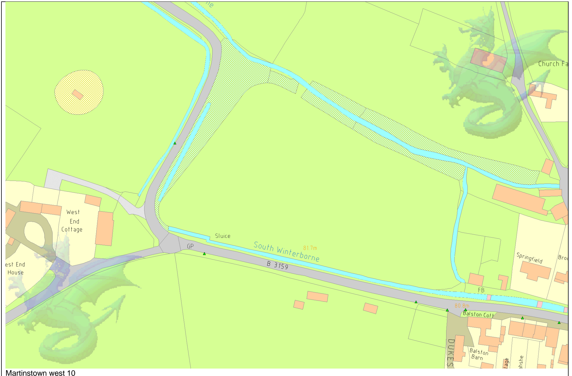
Martinstown west 10