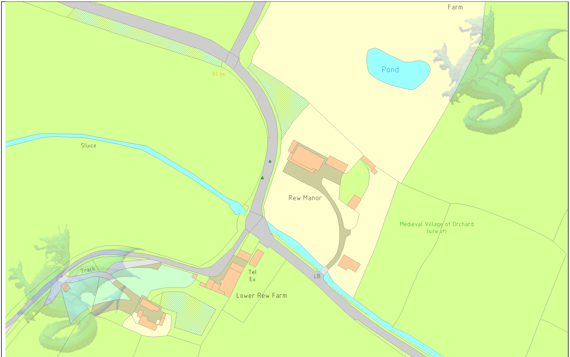
Rew Manor West 08