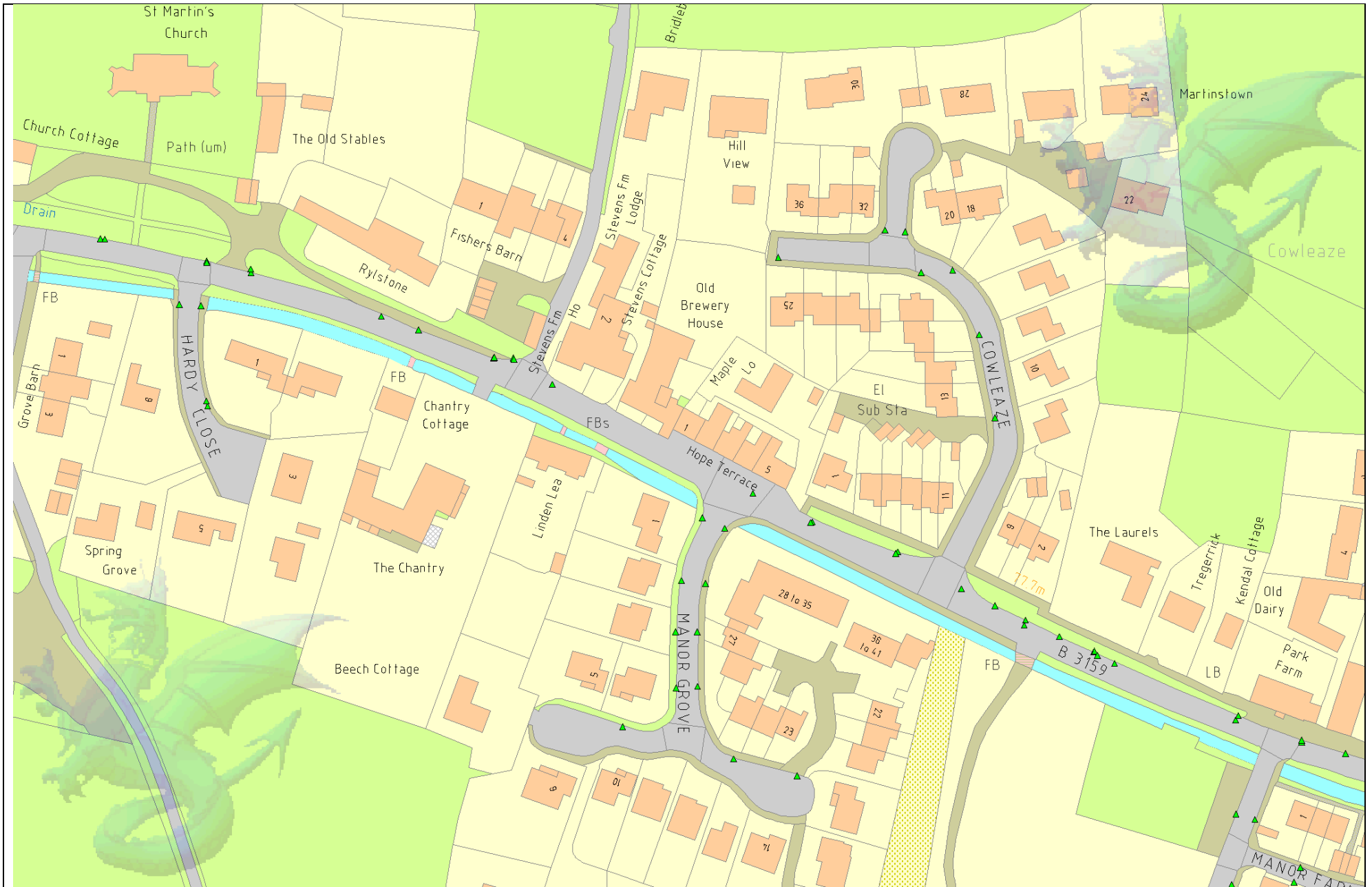
Martinstown centre east 12