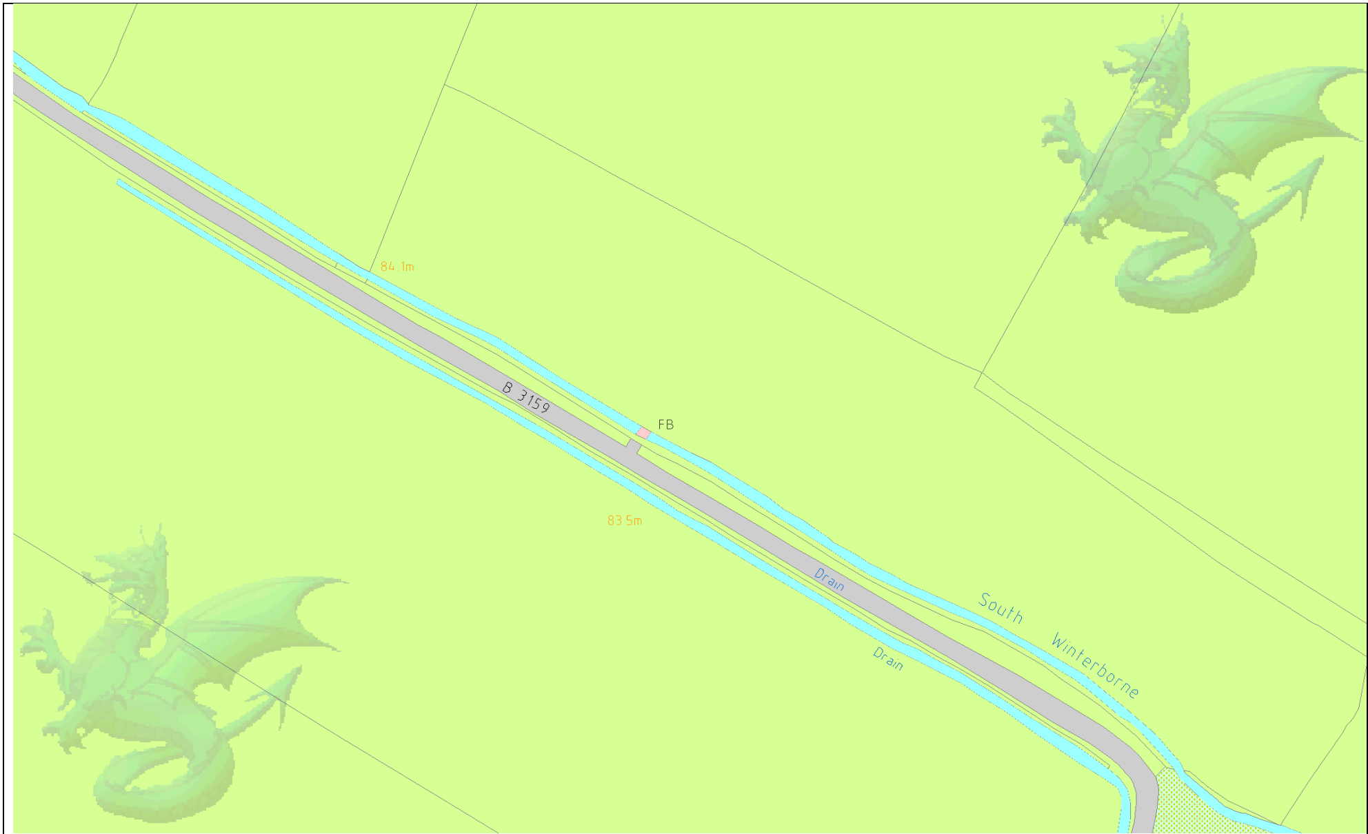
Rew Manor east 09