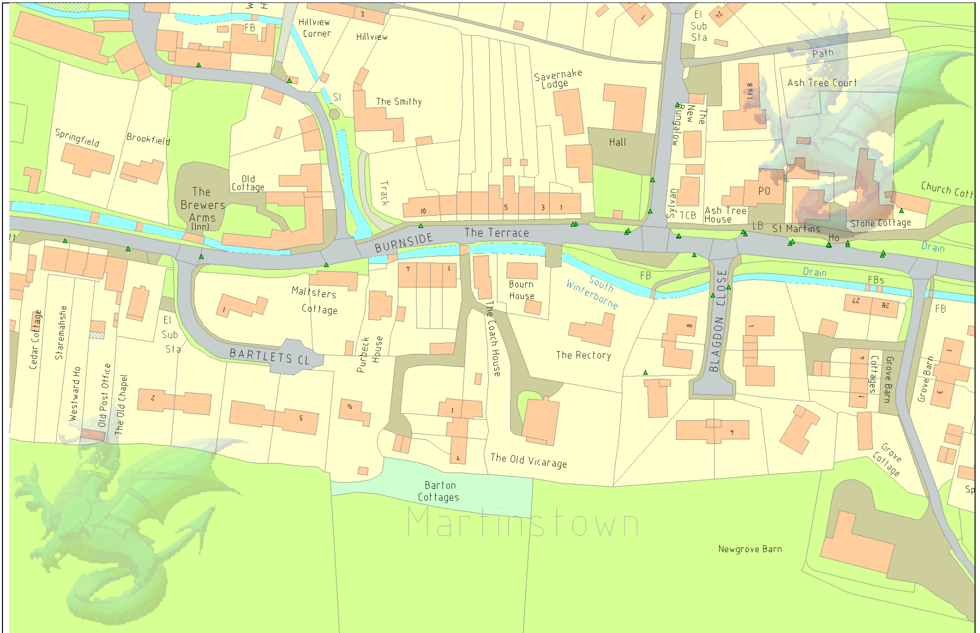
Martinstown centre west 11