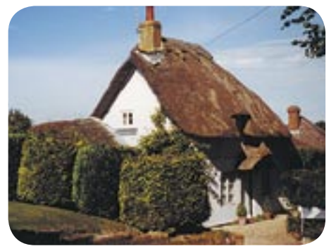
Cob and thatch construction, Woods Lane