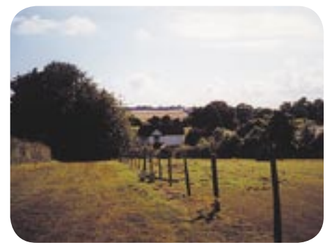
Long range view from the east of Church Farm