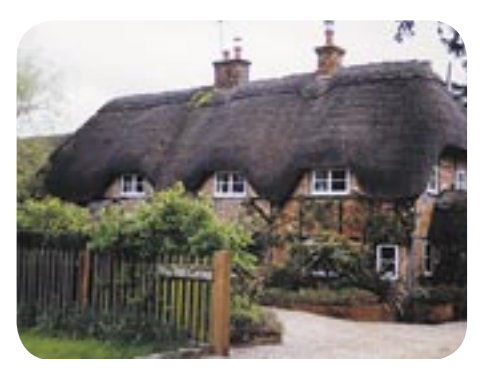
Yew Tree Cottage