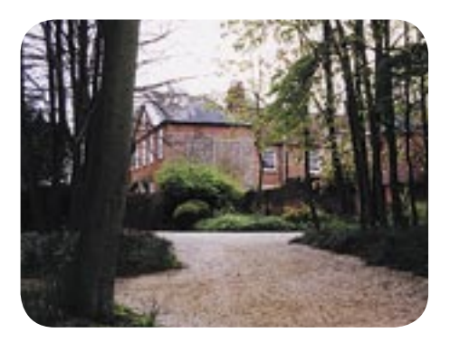
Cliddesden Down House

Woods Lane is a narrow, winding road which climbs from its junction with Farleigh Road to the west of the village. The overhanging trees and tall hedgerows create an intimate rural character, framing glimpses of the buildings along the road. Particularly notable in this respect, are the views of Laithe House, the southern hip end of which is a focal point for the tunnelled views in both directions along the lane. Laithe House is a timber-framed and brick structure and dates from the 17th century with modern alterations. The house and adjacent barn (18th century) sited at right angles to the house form a strong visual grouping, of which their long thatched roofs are a significant feature. Both buildings are listed Grade II.