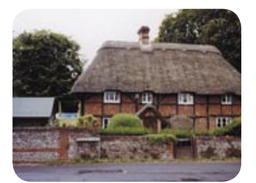
The Well House

Several trees were removed to create a new access road and the development itself has had an obvious effect on the landscape. Only restricted glimpses of the farmhouse can be seen from the main roads, being screened from wider streetscape views by agricultural buildings and trees. However, the red tiled roofslopes and tall chimney stacks of Church Farmhouse add skyline interest to the views northwards across the pond, and indicate the relationship of the farmhouse and farm buildings. As a group the farm and its associated buildings are of significant visual and historic interest to the Conservation Area reinforcing the rural tradition which contribute to its special character. This is particularly notable in views across Cliddesden from the pasture land to the east.