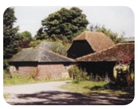
19th century farm buildings -Church Farm