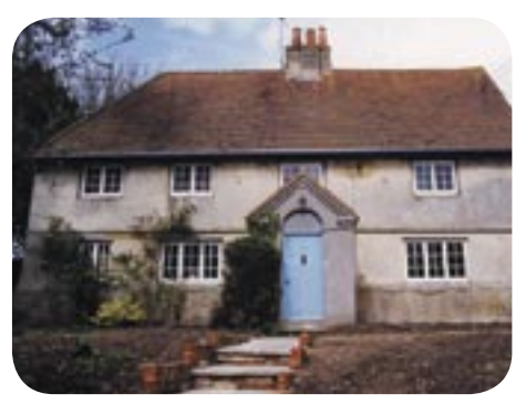
Old School House