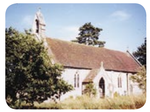
St Leonard's Church

The Church Farm complex to the north is historically related to the pond, which was a former watering place for animals. The barn is the most significant building in the streetscene, the southern gable with low eaves of the aisle on the eastern side, and long uninterrupted roadside elevation, contribute significantly to the character and appearance of the Conservation Area. The long view northwards along Farleigh Road, which includes both The Well House and the barn, is of particular merit. In 2001 the redundant Black Barn was converted for office use and 2 three bedroomed houses constructed with associated parking. This has altered certain views of Church Farm and the granary, but preserves the historic interest of the farm complex. There is also a small weatherboarded granary with a half hipped tiled roof resting on nine staddle stones. The granary is listed Grade II and is visible in views into the farmyard from the pond area. Permission was granted in May 2000 for the erection of 3 four bedroomed dwellings in the field to the rear of The Jolly Farmer and International House.