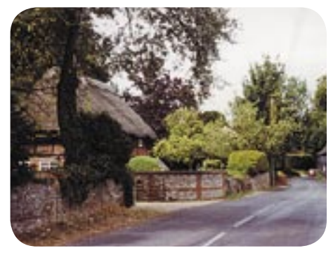
View north-eastwards along Farleigh Road