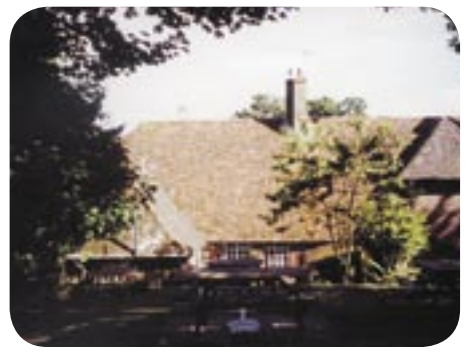
Catslide roof to the rear of the Jolly Farmer