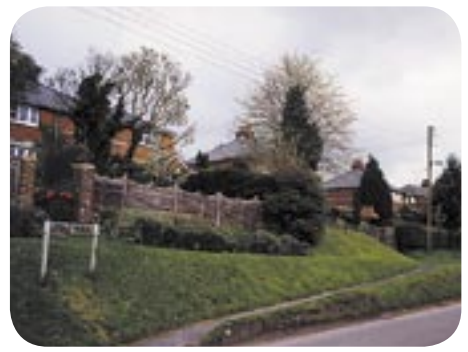
Semi-detached houses, Southlea

The Borough Council provides grants for various types of work. These include Historic Buildings Grants, Environment and Regeneration Grants and Village and Community Hall Grants. Leaflets are available explaining the purpose and criteria for each grant and an approach to the Council is recommended for further information on any grant.