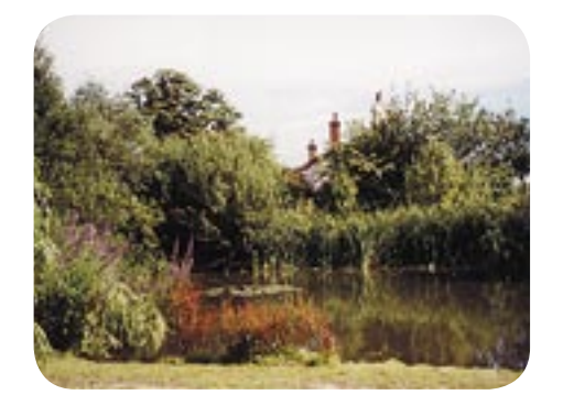
View eastwards of the village pond