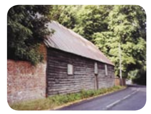
Outbuilding to Cliddesden Down House