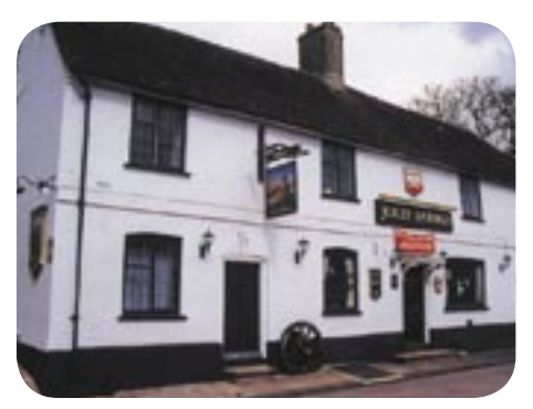
The Jolly Farmer Public House