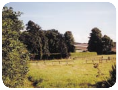
View from the Conservation Area

Later development of the village included a series of fifteen pairs of semidetached houses on the north-west side of Farleigh Road. Wallis and Steevens constructed the distinctive linear group as workers cottages in two stages from approximately 1903 to approximately 1912.