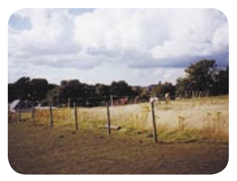
View over Cliddesden from the west of the Conservation Area