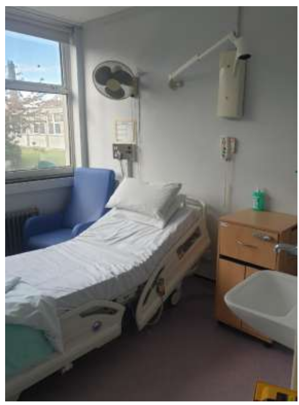
Recovery rooms are small without ensuite

The hospital Trust have already taken action to improve services such as ensuring consultant presence, increase midwife numbers, provide CTG monitoring for baby's heartbeats and provide new "take 5" spaces to give patents the space to speak up.