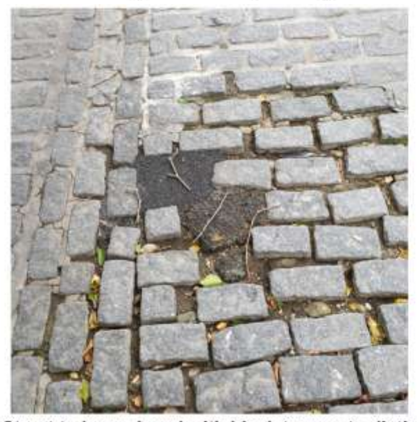
Cobbles in Lower High Street to be replaced with black tarmac to distinguish it from pavement