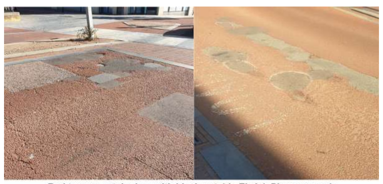
Red tarmac patched up with black outside Elwick Place car park (when retarmacked it will be black tarmac)

The cobbled area on the Lower High Street will be removed and replaced with tarmac as they present a trip hazard and have become unsightly. This work will start in January 2023.