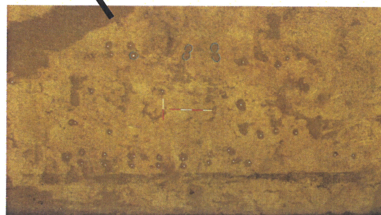
Enlarged view of building