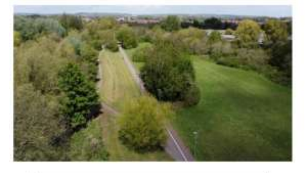
Queen Mothers Park – Before Meadow Extension

The change still allows use by residents, with a large area of amenity maintained as "kick about area" and cut pathways throughout the meadow areas for dog walking. The next stage of the development of Queen Mothers Park, will be the installation of 40 specimen broad leafed mature trees across 2 planting seasons.