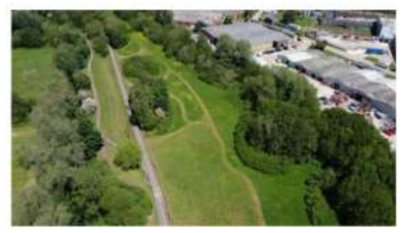
Queen Mothers Park – After Meadow Extension