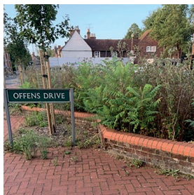
The Parade, before...

There are now four large and two smaller wooden planters in the shopping centre, with more planned, where we will continue to display flowers on a seasonal basis. Additionally, we are in the process of preparing a number of beds and other sites locally with the intention of growing cultivated perennials or wildflowers from seed bulbs or as plug plants.