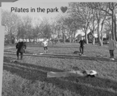
Pilates in the park ♥