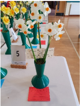
Steve Bowcutt Best in show for flowers