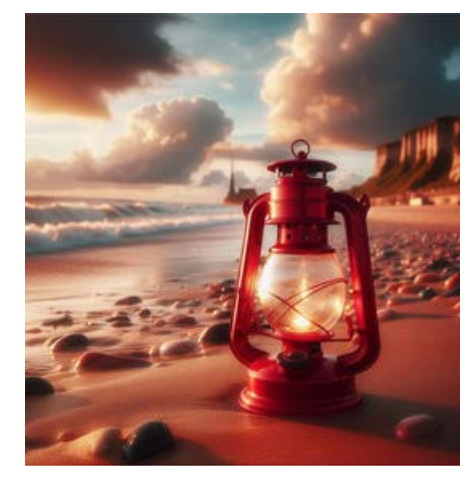
'Lamp Light of Peace' for individuals and organisations to engage with D-Day 80 on 6th June 2024

*The biggest food awareness day of the year, National Fish and Chip Day, will be back in 2024 for its 9th year and we are delighted to be moving the day from its traditional Friday slot to Thursday 6th June 2024, in support of the D-Day 80 celebrations.