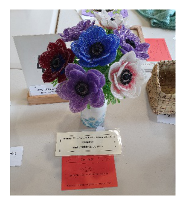
Sue Fripp Beautifully crafted bead and wire flowers