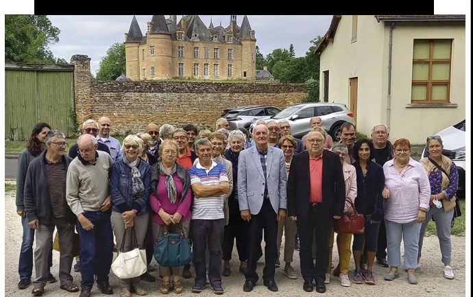
Members of Dymchurch and Salbris Twinning Association on a visit to a privately owned chateau kindly arranged by the Mayor of Salbris

2023 will mark 41 years since Salbris in France first established a link with Dymchurch, initially via our two fire brigades, before being formalised into The Twinning Association we know today. Twinning aims to develop cultural, tourist, economic and social relations with exchanges between the two towns, occurring twice a year. In 2022 Dymchurch members were able