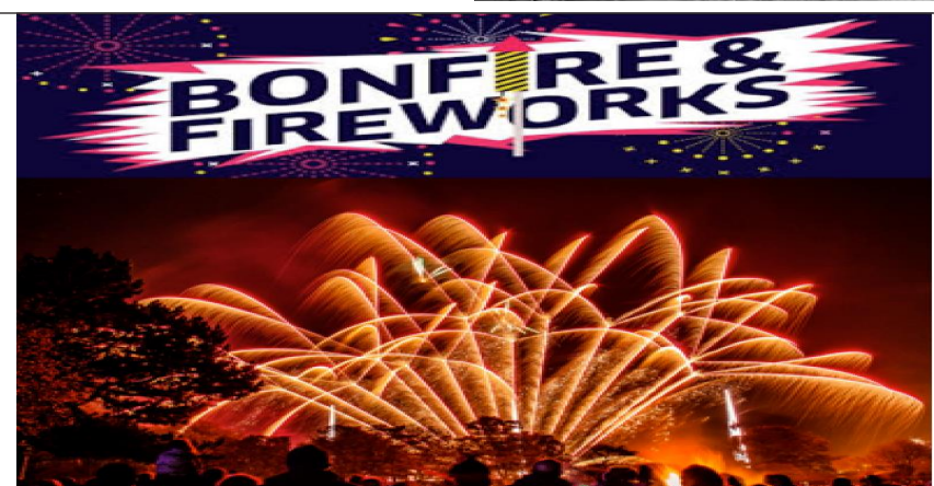
THE VILLAGE HALL COMMITTEE ARE PLEASED TO ANNOUNCE THAT THE VILLAGE BONFIRE PARTY IS BACK!