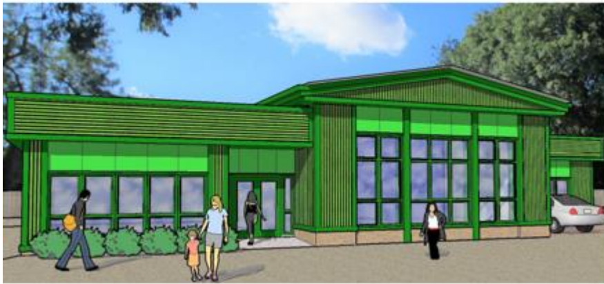
Both designs are conceptual providing a broad outline of what might be possible